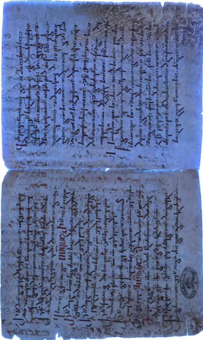
Figures 1–2. Vat. Iber. 4, ff. 5r + 1v (= recto)

© Biblioteca Apostolica Vaticana. Reproduced by permission of Biblioteca Apostolica Vaticana, with all rights reserved.